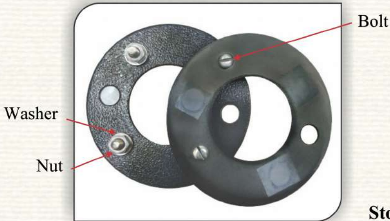
Stone / Burr Support Plate with Bolt-Nut Kit.